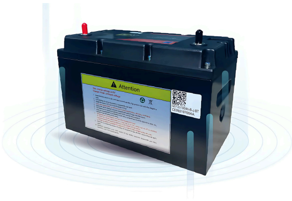
2-in-1 Starter & eAPU Smart Lithium Truck Battery